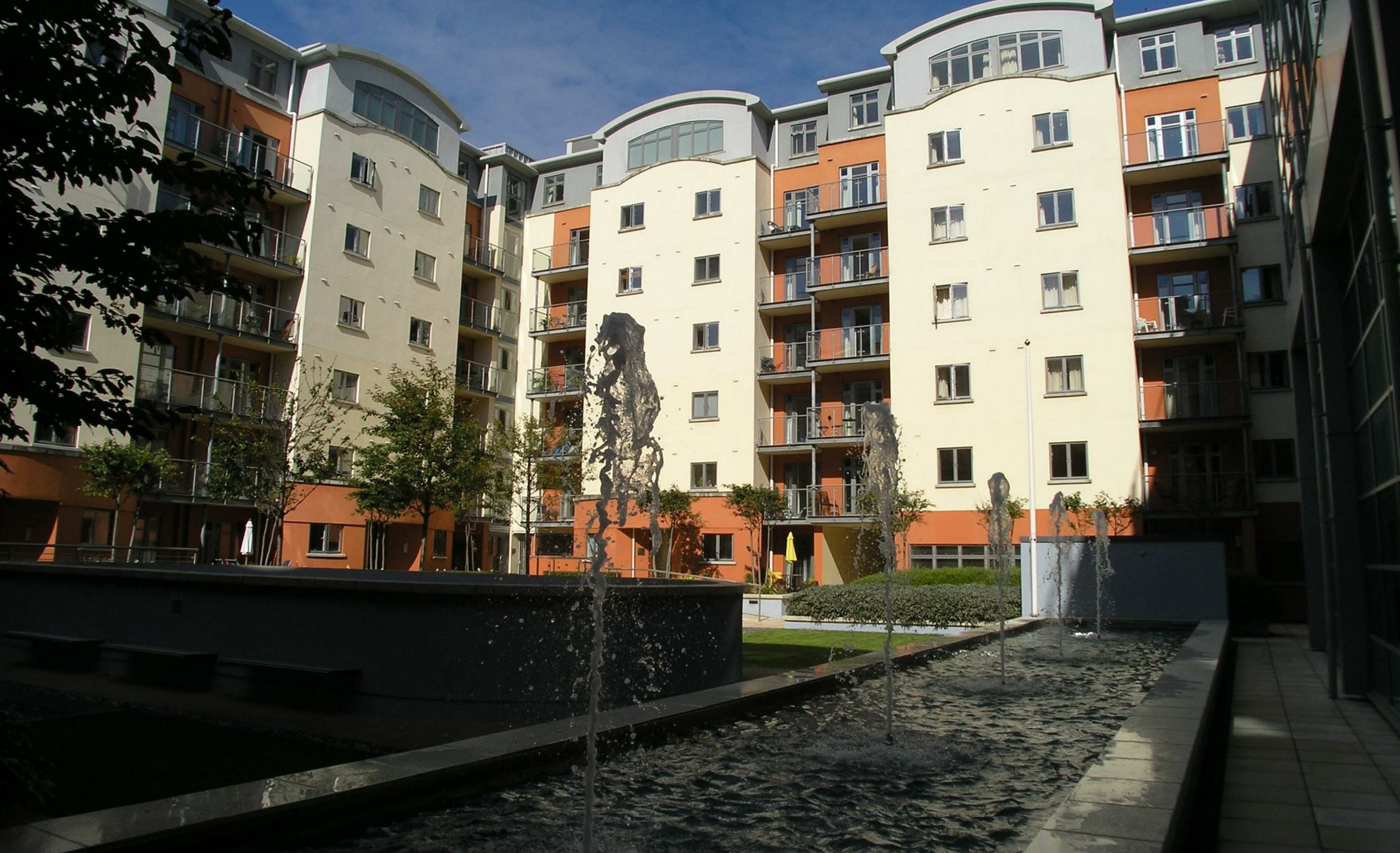
95 Century Buildings Patriotic Place, St Helier, Jersey, JE2 3AF £435,000